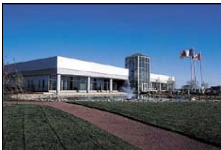
Depending on the application and architectural treatments, a metal building system can look no different than other construction.

the contract documents. The EOR may also review the shop drawings prepared by the contractor (or subcontractor or manufacturer). In some cases, construction contracts require the contractor to provide delegated design engineering to a licensed professional. The engineering is based upon the manufacturer's specific component properties and may be performed by the manufacturer or by an experienced independent structural engineer.