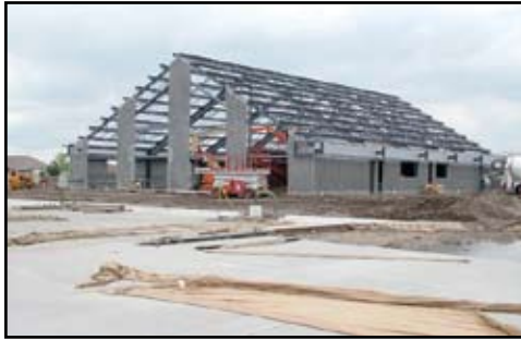
A metal building system with a steep roof and masonry wall cladding.

Therefore, an EOR working on a metal building project with a certified manufac-