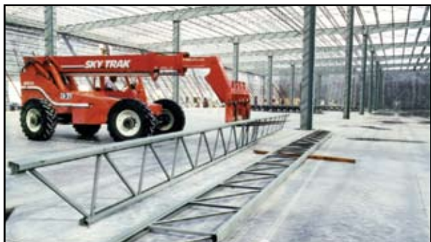
For longer spans, bar joists are used instead of cold-formed purlins.

In the sale of most metal building systems, there are at least two independent written agreements – the building order documents and the contract documents. The order documents are normally required to process the order for the metal building system, while the contract documents (including the drawings and specifications) define the material and work to be provided by the contractor for the total construction project. The manufac-