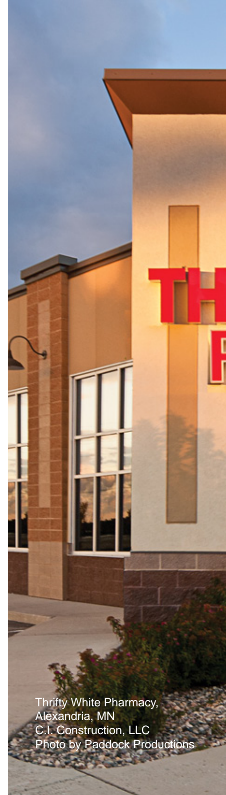
Thrifty White Pharmacy, Alexandria, MN C.I. Construction, LLC

As part of the Change the Culture priority, MBMA revised its Safety Awards program for 2010. The new program toughened the criteria for recognition and made the awards based on the calendar year. As a result, the 2010 MBMA Safety Awards were presented at the MBMA Spring Meeting. Thirty-six awards were presented and five plants earned the top recognition, Superior Overall Safety Record.