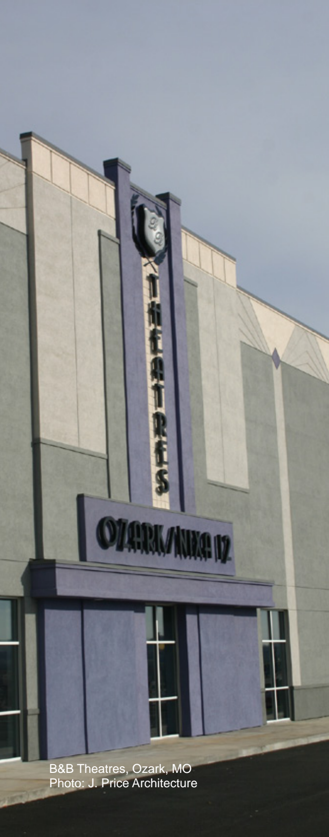
B&B Theatres, Ozark, MO Photo: J. Price Architecture