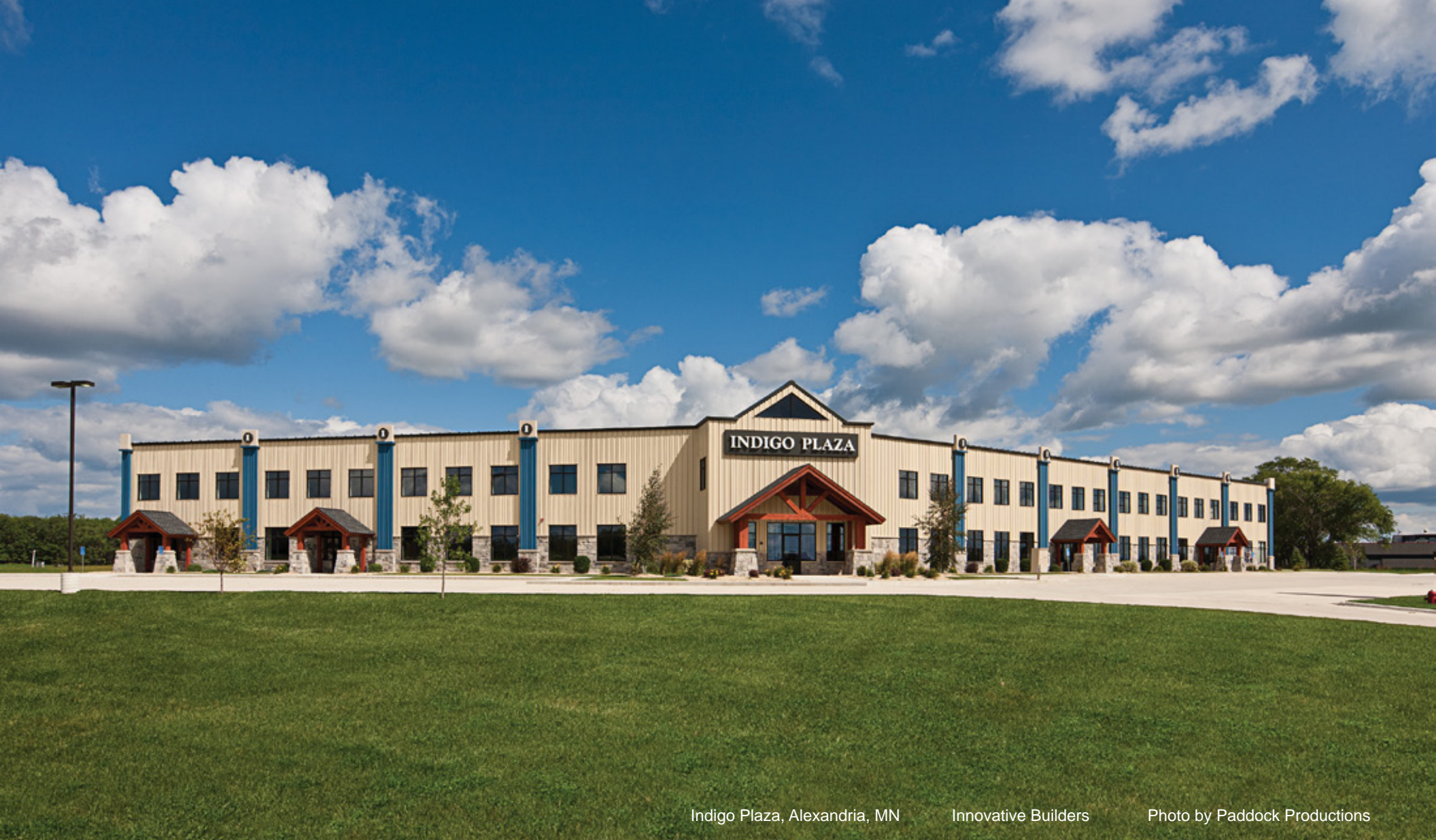
Indigo Plaza, Alexandria, MN