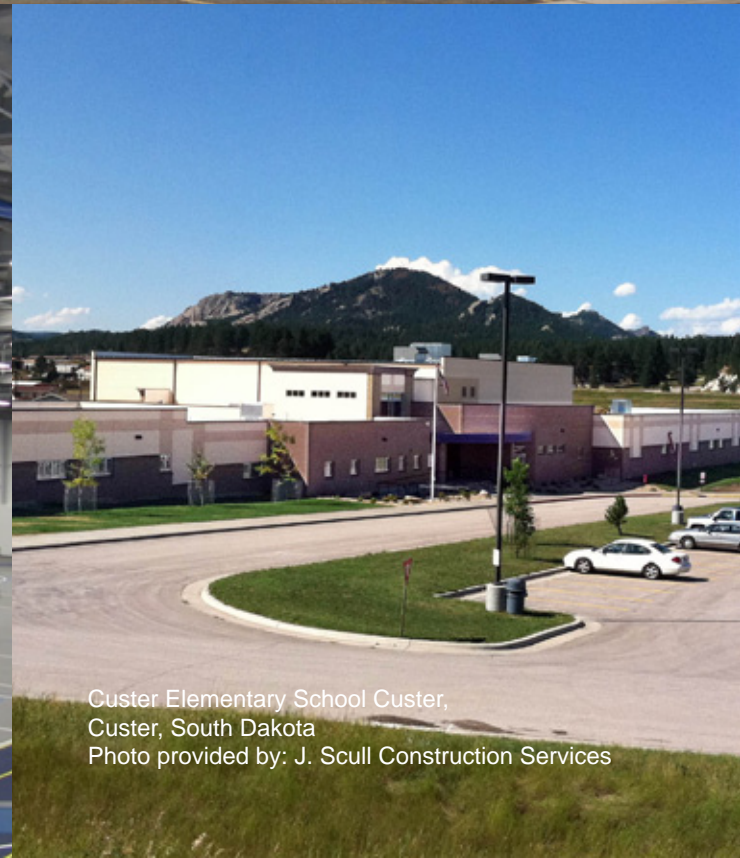
Custer Elementary School Custer, Custer, South Dakota