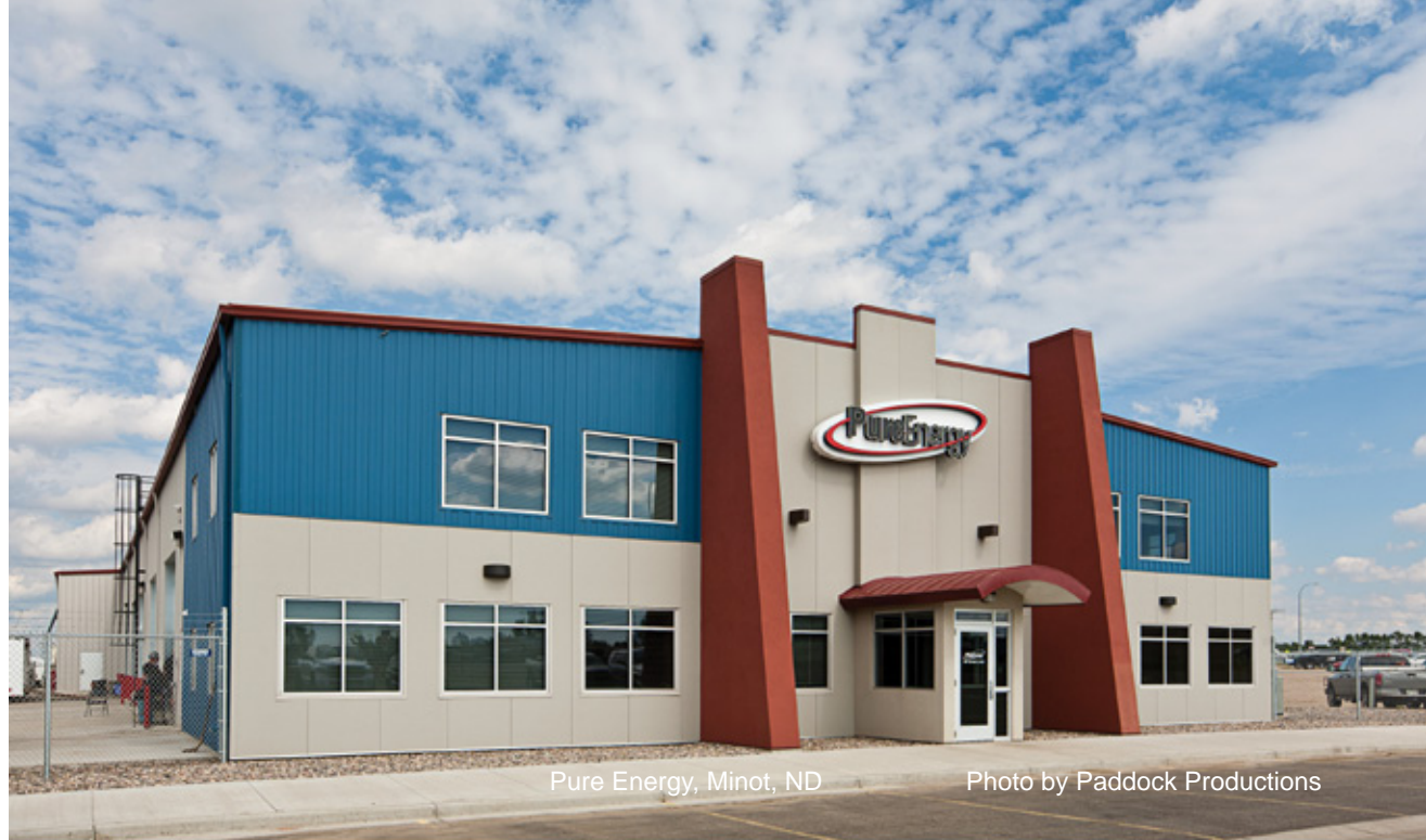
Pure Energy, Minot, ND