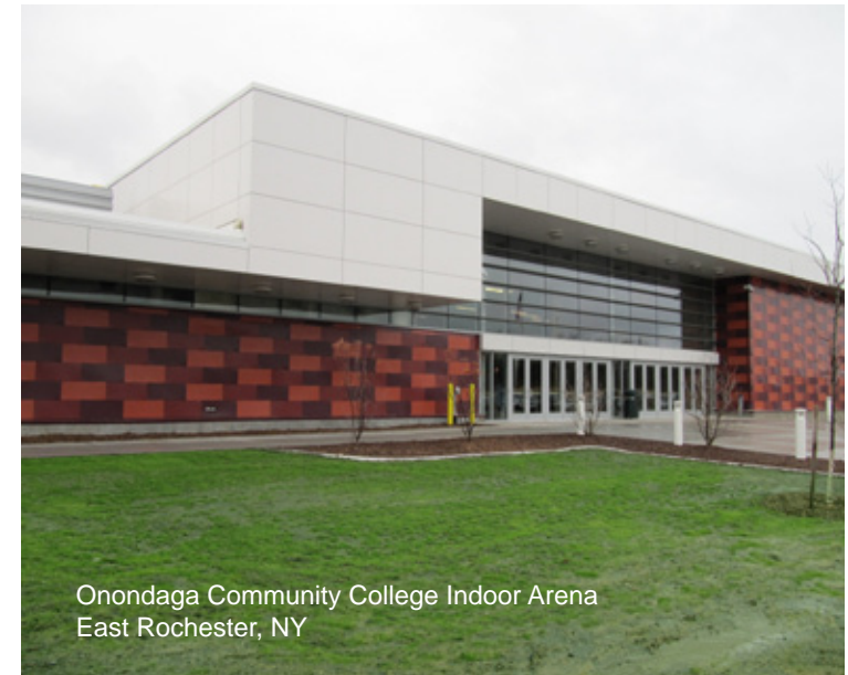
Onondaga Community College Indoor Arena East Rochester, NY

Achieving these goals will further position metal building systems as an optimal green and sustainable building choice.